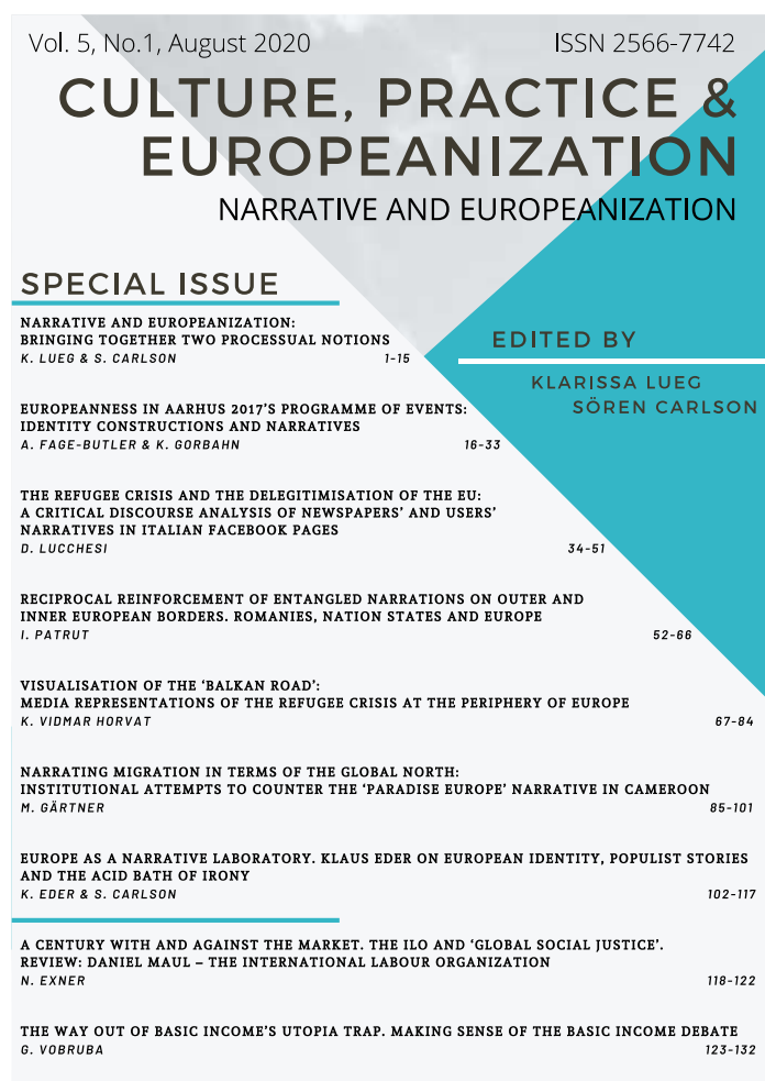
Abb. 4: Culture, Practice and Europeanization, Vol. 5/ No. 1

The peer-reviewed journal " Culture, Practice and Europeanization " (CPE) is linked to ICES. CPE is a multidisciplinary, open-access journal. Editors are Monika Eigmüller (EUF) & Klarissa Lueg (Syddansk Universitet).