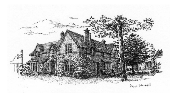
House of Theological Studies The Evangelical Lutheran Church of England A registered charity

From the earliest days it was clear that Westfield is a resource with a value reaching far beyond the ELCE. In addition to training UK students, Westfield House helps to train students from countries where there is limited access to confessional Lutheran training, or who require a higher qualification in order to teach in their home seminary.