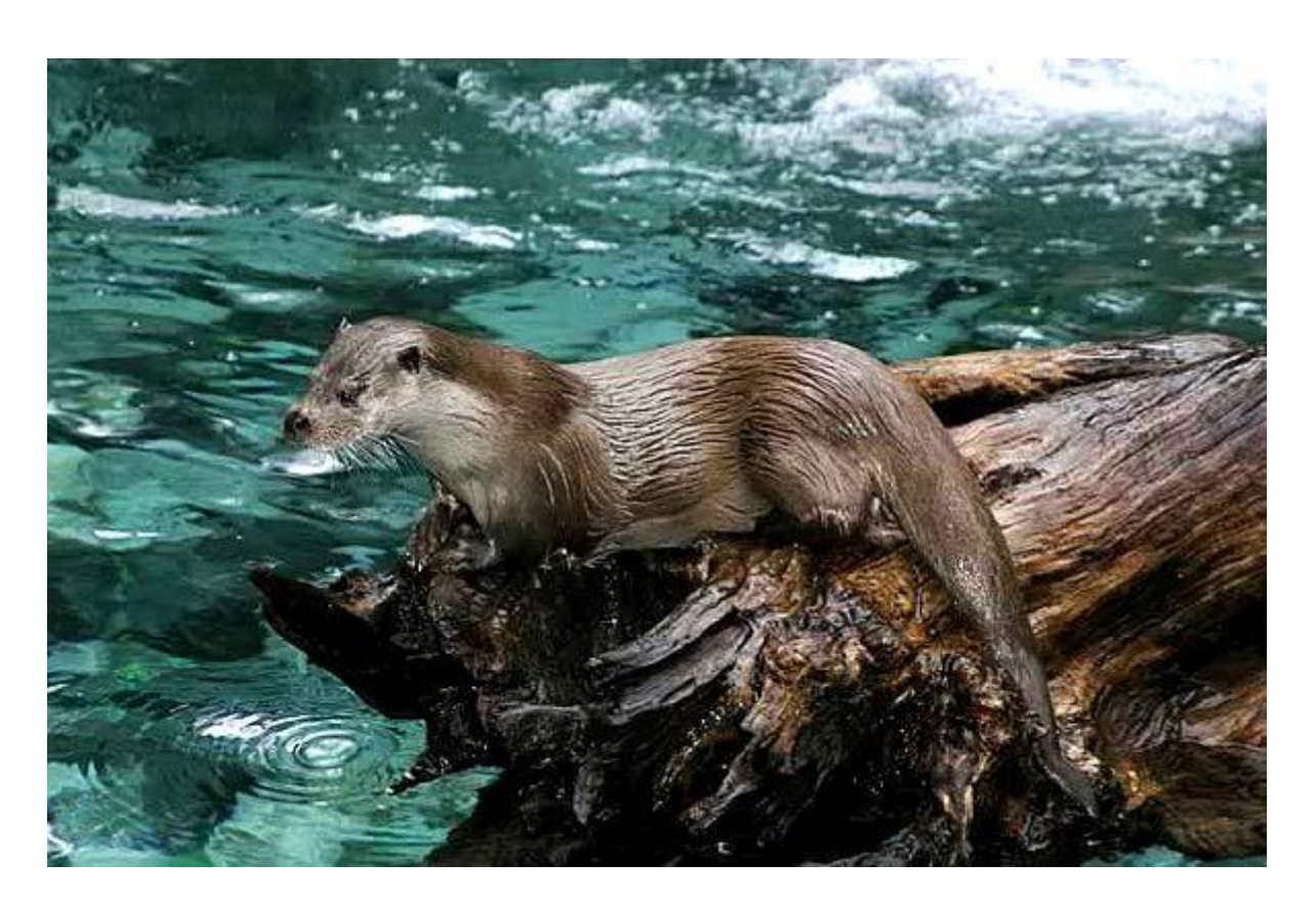
Lutra lutra pyrénées, Baronnies

Factories are another threat. They pollute and poison the water by disposing of their sewage in the rivers.