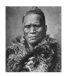
Fig. 2:. Tāwhiao, second Māori King, died 26th Aug. 1894 (Anonymous, ca. 1894)

In the 13th and 14th century New Zealand was settled by Polynesian settlers who created the Maori culture.