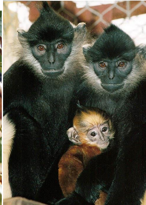
Picture 1: http://im.rediff.com/news/2012/oct/22species14.jpg (04.01.14)