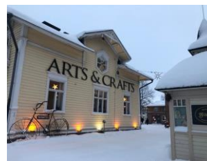
Cozy café in Joensuu