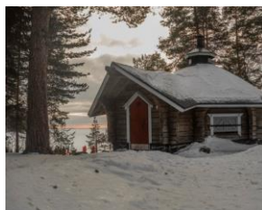
Little hut next to Lake in Joensuu