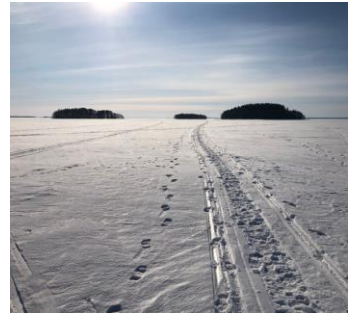
Frozen Pyhäselkä Joensuu