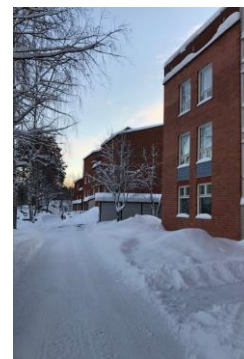
Student accommodation "Karjamäentie" in Joensuu