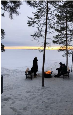
Typical BBQ (normally with more people)