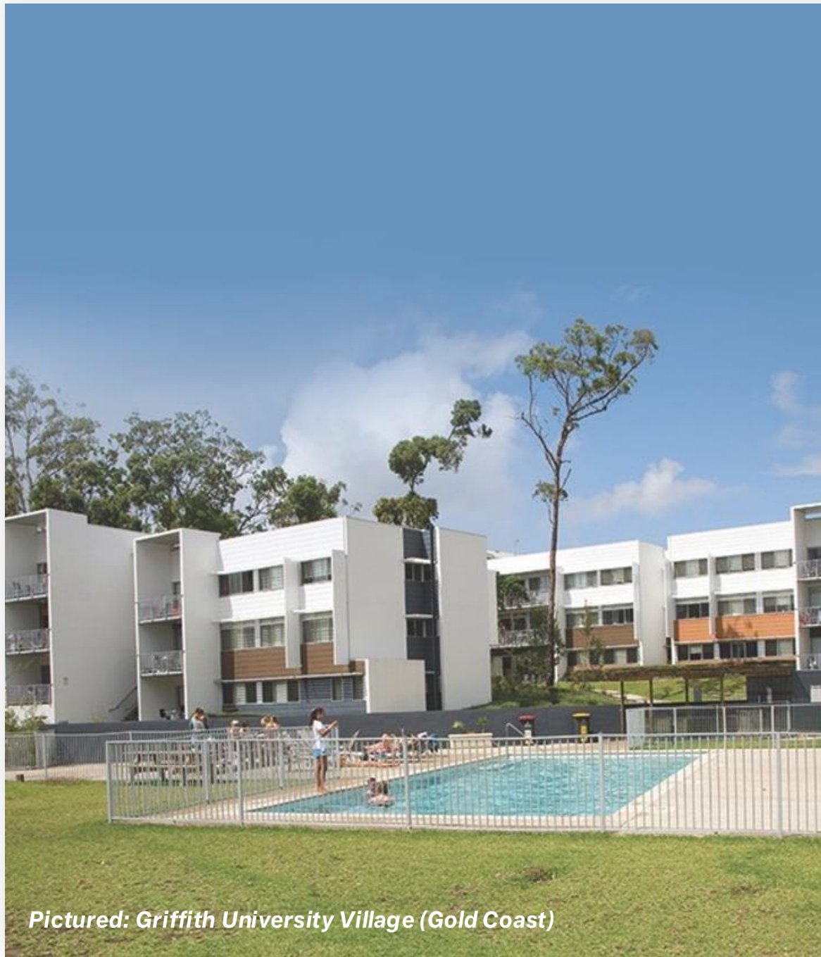
Pictured: Griffith University Village (Gold Coast)