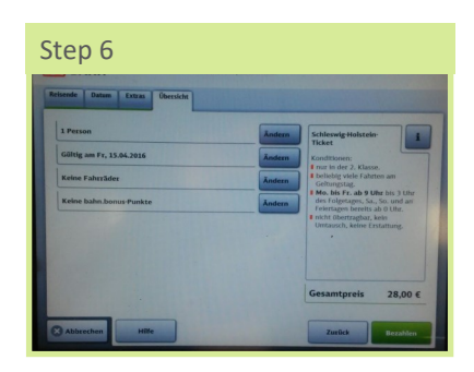
Step 6: Pay for ticket