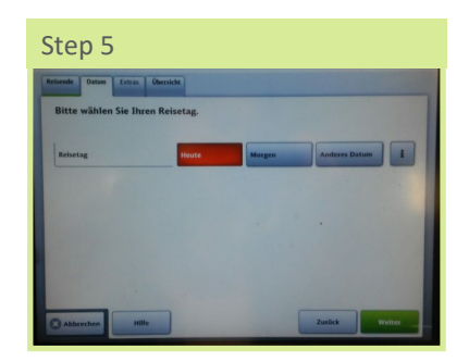
Step 5: Select departure day