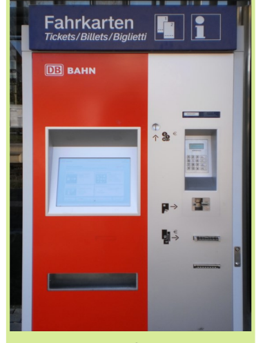
Ticket Machine for suburban ( S Bahn ) and regional trains