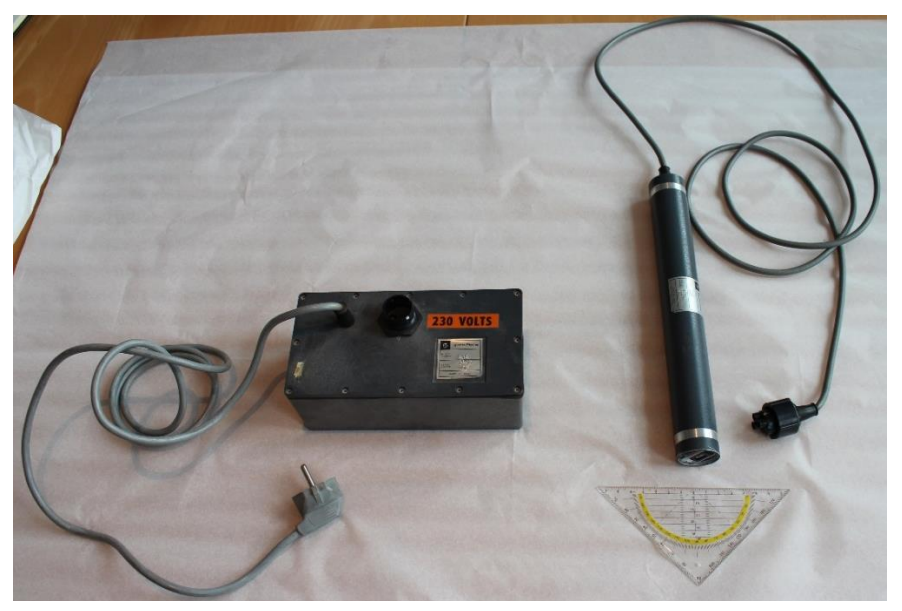
Fig. 2 He-Ne Laser and power supply/exciter.

The instrument encompasses two separate parts (see Fig. 2). The first is a parallelepiped plastic box with grey colour. It appears to have been used, with some scratches, dust and old label traces.