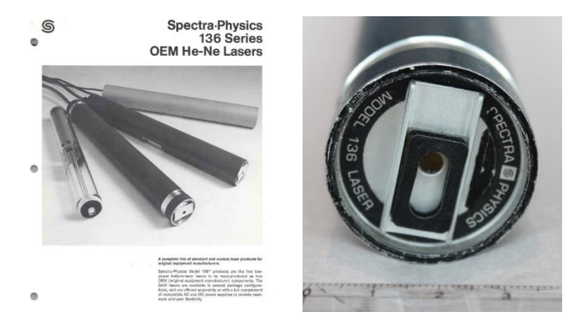
Fig. 4 and 5 Spectra Physics 136 Series Catalogue. Adapted from: https://www.repairfaq. org/sam/brochures/SPOHLC1975/index.html and Laser model 136 from Deutsches Museum Munich (inv. N. DMM 2016 - 3T1) © Miguel Teixeira.

The front of the laser tube appears to be different from what is advertised in the trade catalogue (see Fig. 4). Probably, during the use of the instrument, the front cover was lost and today the laser is uncovered. The laser in study is only accompanied by a power source/exciter (see Fig. 2). Perhaps this laser worked with the aid of a mount support, as recent lasers do today. This is the case of Newport company, the present owner of Spectra-Physics (Newport Corporation, no date).