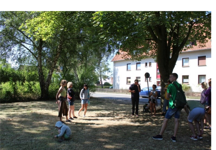
1950's: Houses in the background were build on good farmland

• Since 2017: Landwende e.V. aims to reestablish farmland around the town to provide inhabitants with local food and reactivate the local economy by cooperating with local producers