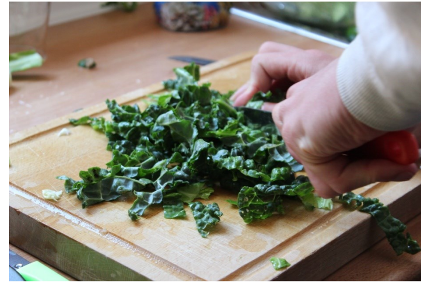
Community cooking with self