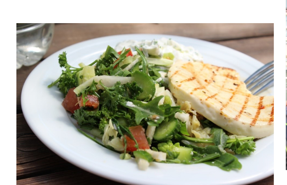
Healthy meal cooked with locally produced food