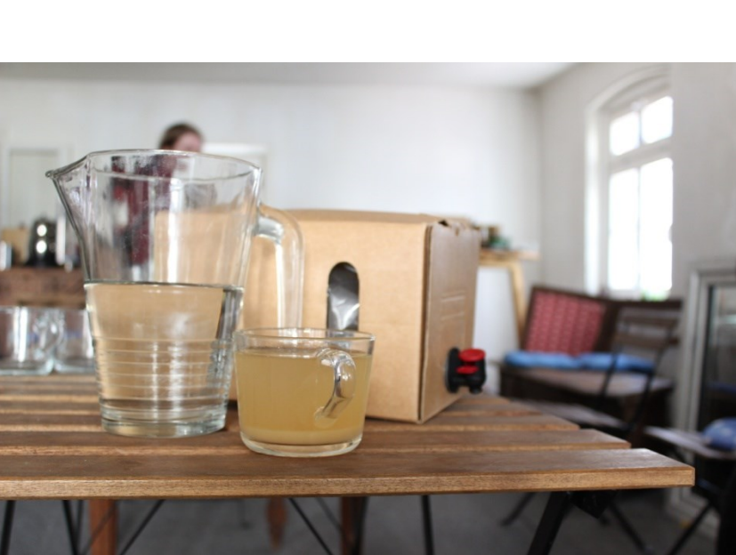
Tasting juice of a rare apple cultivar in the future coffee shop