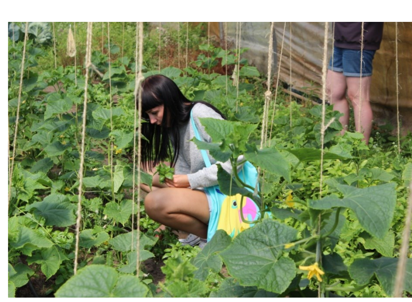
Harvesting vegetables and herbs of the season