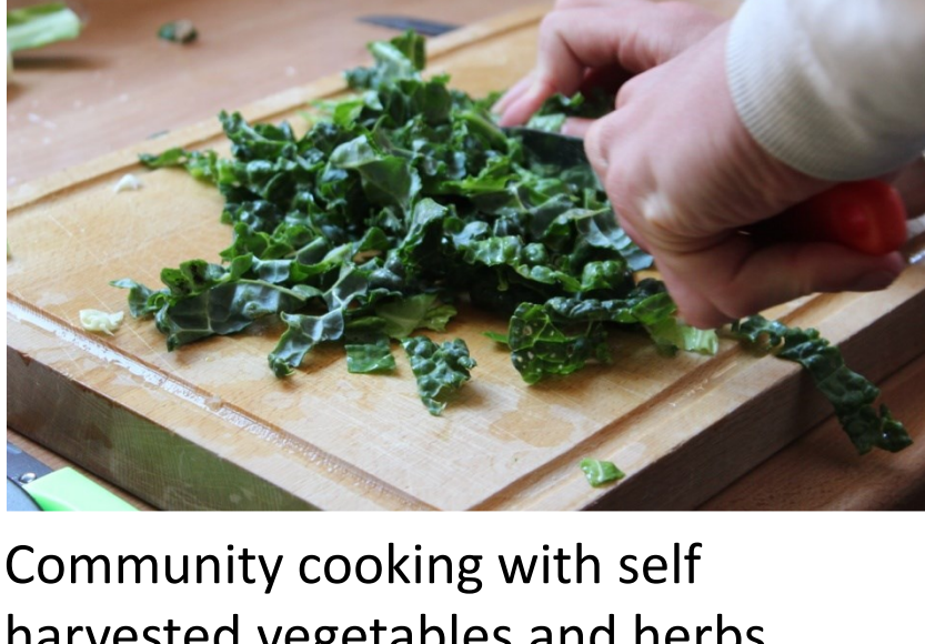
harvested vegetables and herbs