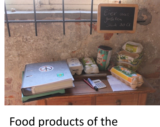
Landwende: (honey, marmelades, eggs, sausage)