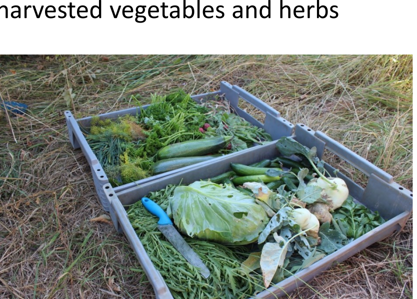
Successful harvest: Cabbages, cucumbers, herbs, and more