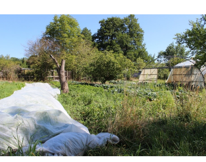
Variety of plants and ecological farming support animal diversity