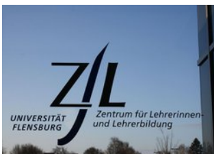
› The Centre of Teacher Training (ZfL)

The Centre of Teacher Training deals with the conceptual design and coordination of the school internships that form part of the teacher training program. It also supports research into schools, education and teacher training and represents the Department of Teacher Training of Europa-Universität Flensburg in regional, national and international thematic contexts. In addition, ZfL is responsible for the partial study courses in the field of "Education and Training".