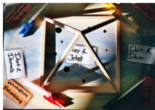
› Centre of Academic Further Education (ZWW)