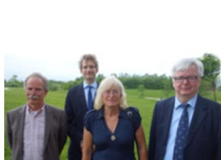
› Centre of Lesser Used Languages and Regional Languages (in formation phase)