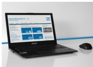
› Center of Information and Media Technologies (ZIMT)