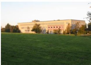
› Central University Library (ZHB)

Finally, the university has a number of central institutions which mainly provide services. These include: