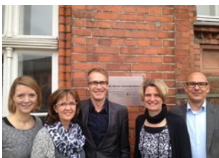
› Dr. Werner Jackstädt Centre (DWJZ)

Together with the University of Applied Sciences in Flensburg, the European University is involved in start-up and SME research (DWJZ) and in research into sustainable energy systems (ZNES):