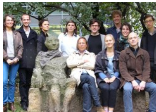
› Norbert Elias Center (NEC)