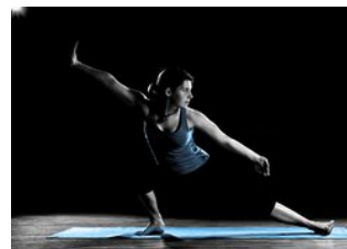
› Sports Centre

Back to top Page # 10220 Permalink 04/15/2020