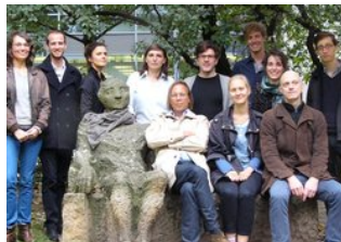
› Norbert Elias Center (NEC)