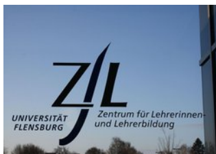
› The Centre of Teacher Training (ZfL)

The Centre of Teacher Training deals with the conceptual design and coordination of the school internships that form part of the teacher training program. It also supports research into schools, education and teacher training and represents the Department of Teacher Training of Europa-Universität Flensburg in regional, national and international thematic contexts. In addition, ZfL is responsible for the partial study courses in the field of "Education and Training".