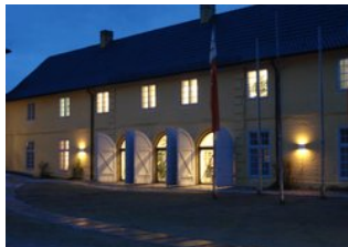
› Forschungsstelle für regionale Zeitgeschichte und Public History (frzph)

The following research institutions are also currently established at Europa-Universität-Flensburg as central scientific institutions: