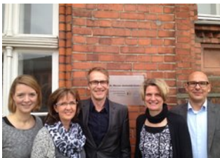
› Dr. Werner Jackstädt Centre (DWJZ)

Together with the University of Applied Sciences in Flensburg, the European University is involved in start-up and SME research (DWJZ) and in research into sustainable energy systems (ZNES):