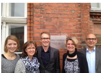
› Dr. Werner Jackstädt Centre

Together with the University of Applied Sciences in Flensburg, the European University is involved in start-up and SME research (DWJZ) and in research into sustainable energy systems (ZNES):