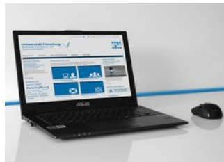
› Center of Information and Media Technologies (ZIMT)