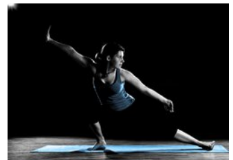
› Sports Centre