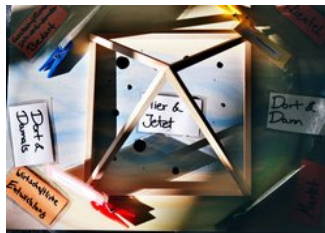
› Centre of Academic Further Education (ZWW)