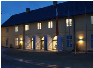
› Forschungsstelle für regionale Zeitgeschichte und Public History (frzph)

The following research institutions are also currently established at Europa-Universität-Flensburg as central scientific institutions: