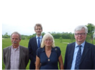
› Centre of Lesser Used Languages and Regional Languages (in formation phase)