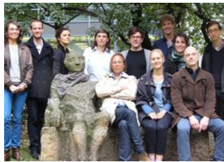
› Norbert Elias Center (NEC)