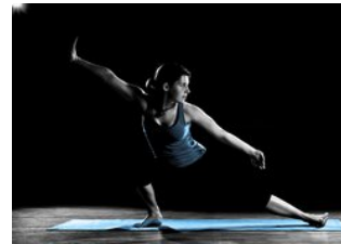
› Sports Centre

Back to top Page # 10220 Permalink 04/15/2020