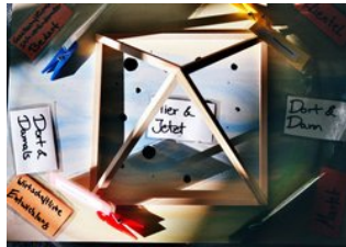
› Centre of Academic Further Education (ZWW)