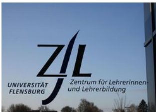
› The Centre of Teacher Training (ZfL)

The Centre of Teacher Training deals with the conceptual design and coordination of the school internships that form part of the teacher training program. It also supports research into schools, education and teacher training and represents the Department of Teacher Training of Europa-Universität Flensburg in regional, national and international thematic contexts. In addition, ZfL is responsible for the partial study courses in the field of "Education and Training".