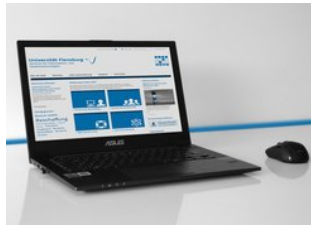
› Center of Information and Media Technologies (ZIMT)