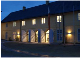
› Forschungsstelle für regionale Zeitgeschichte und Public History (frzph)

The following research institutions are also currently established at Europa-Universität-Flensburg as central scientific institutions: