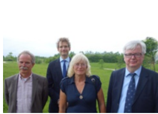
› Centre of Lesser Used Languages and Regional Languages (in formation phase)