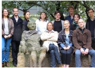
› Norbert Elias Center (NEC)