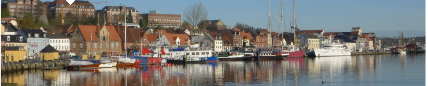
University homepage > Prospective Students > CampusLife > The City of Flensburg