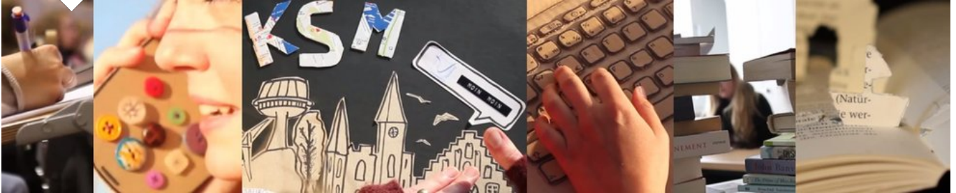
University homepage > Students > Courses of Studies > Master > Kultur-Sprache-Medien (KSM)