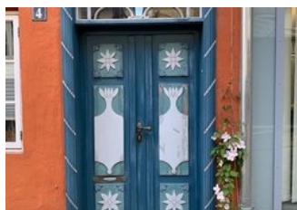
› Phase 3 - Staying in Germany