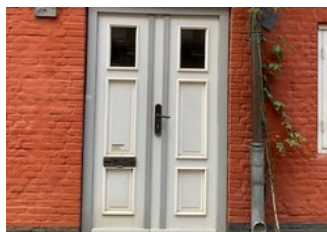
› Phase 1 - Welcome support