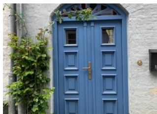
› Phase 2 - During your studies