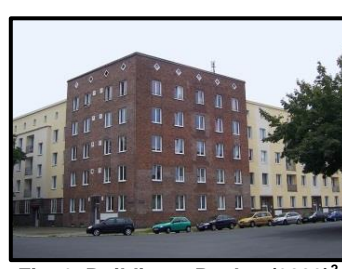
Fig. 2, Buildings, Paulae (2009)